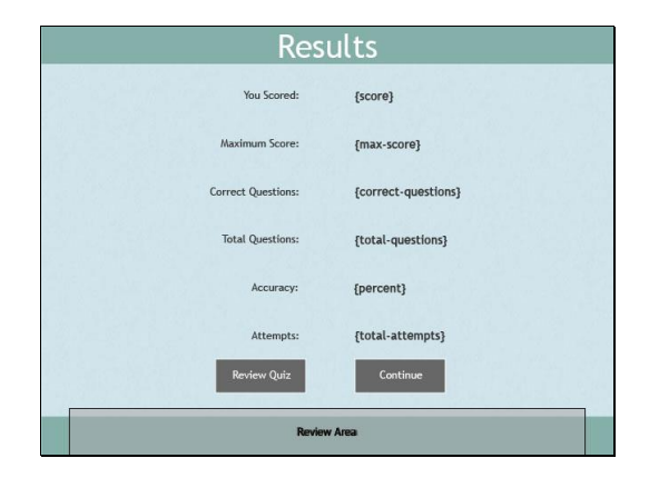
Slide 3 - Slide 3